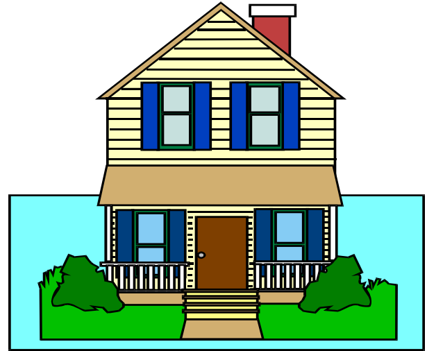
COMMUNITY DEVELOPMENT BLOCK GRANT

NO-INTEREST DEFERRED HOUSING REHABILITATION LOANS TO HOMEOWNERS IN TARGETED AREAS OF KANE COUNTY.