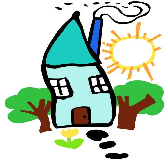
Home Investment Partnership Program

FIVE OR TEN YEAR NO-INTEREST FORGIVABLE HOUSING REHABILITATION LOANS TO SINGLE FAMILY OWNER OCCUPIED HOMES IN DEKALB COUNTY.